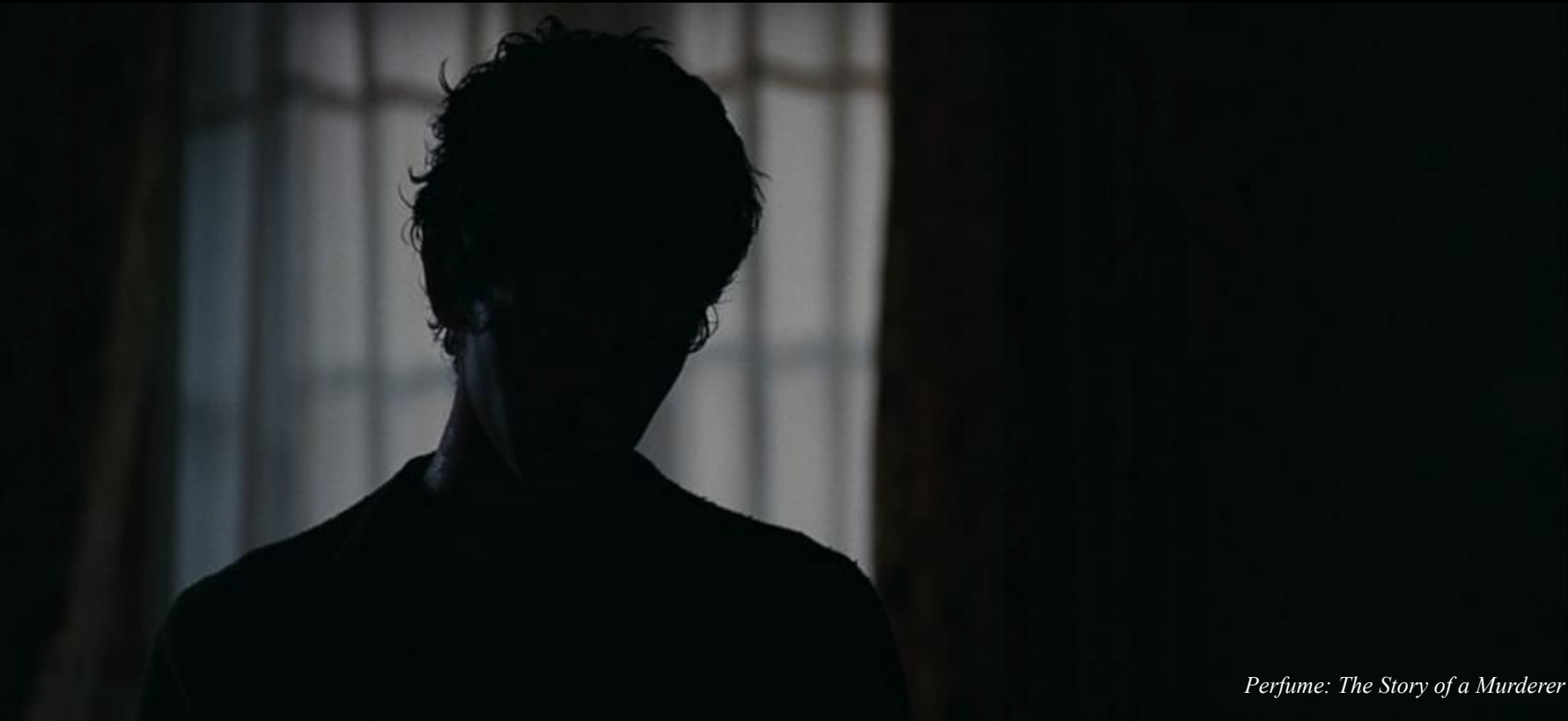
Perfume: The Story of a Murderer (2006)